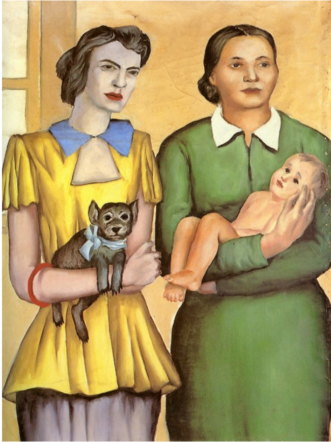
The exhibition's organizer,

major exhibition at the National Museum in Beijing, organised by the National Museum in Warsaw. It runs 7 February - 10 May.