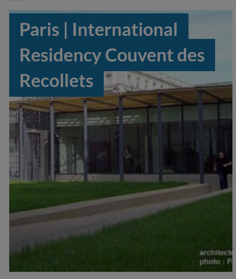
POSTED ON 06 OCT 2021