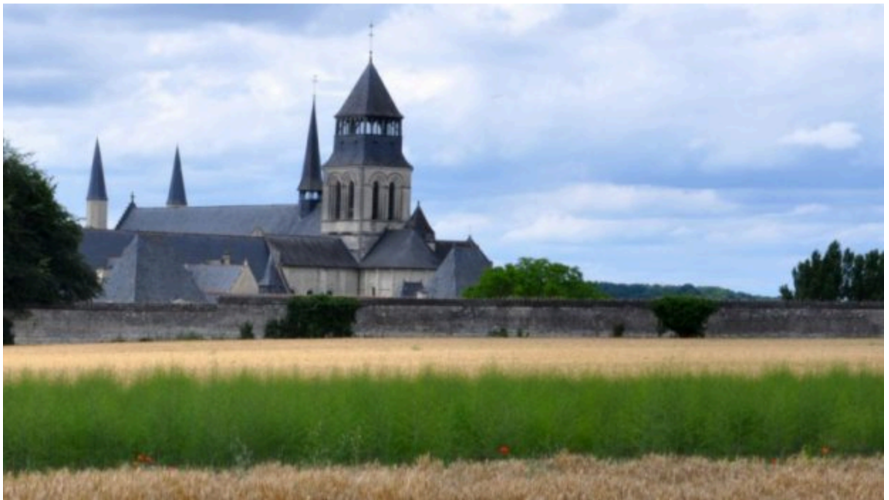
Vue de l'Abbaye de Fontevraud[/caption]

This residency program receives the financial support of the French Ministry of Culture and Communication, through the «Odyssée» program of the Association of Cultural Encounter Centres (ACCR). It also enjoys the partnership of FOCAL Foundation, Annecy Animated Film Festival, Meknes Animated Film Festival, Angers European First Film Festival and Folimage Young Audience Residency.