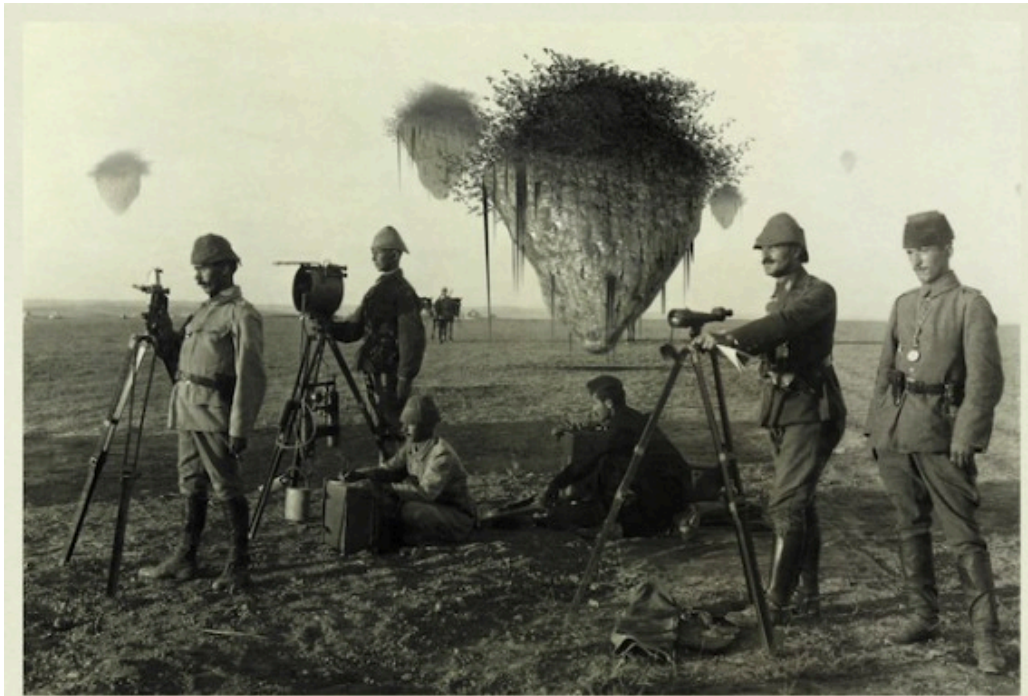
Figure 8. Ottoman heliograph crew at Huj during World War I, 1917.