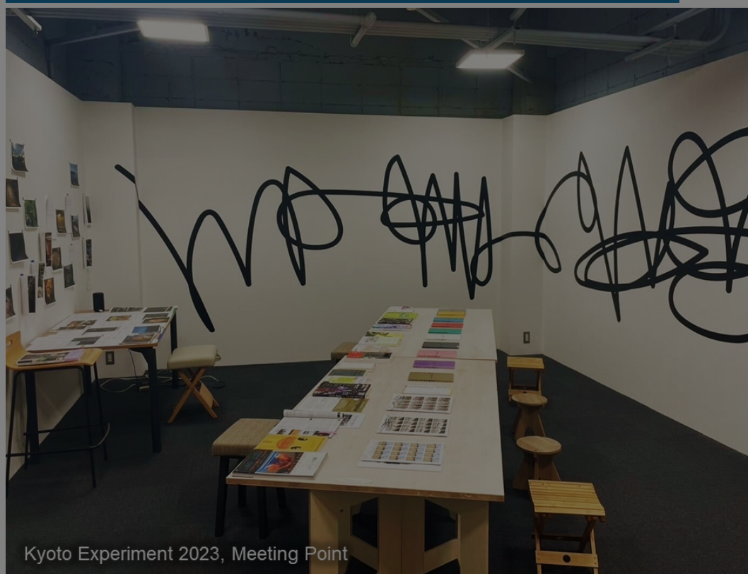
Kyoto Experiment 2023, Meeting Point