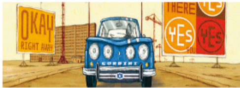
Computer Animation / Film / VFX