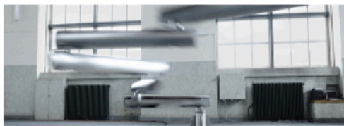
Digital Music & Sound Art