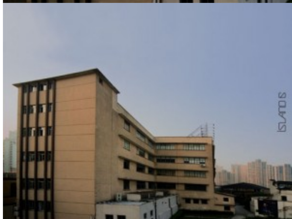
island6 Arts Center Residency