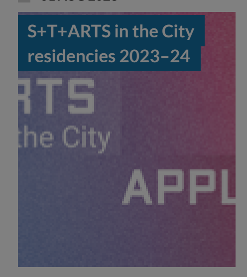
POSTED ON 29 AUG 2022