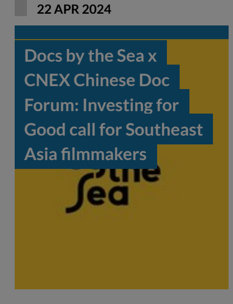
OPEN CALLS ASIA CHINA INDONESIA