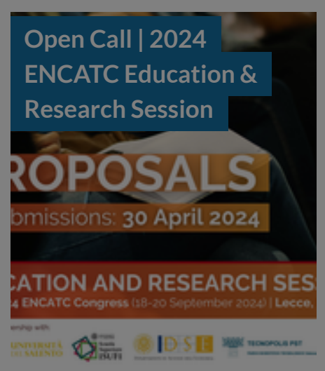
OPEN CALLS ASIA EUROPE ITALY