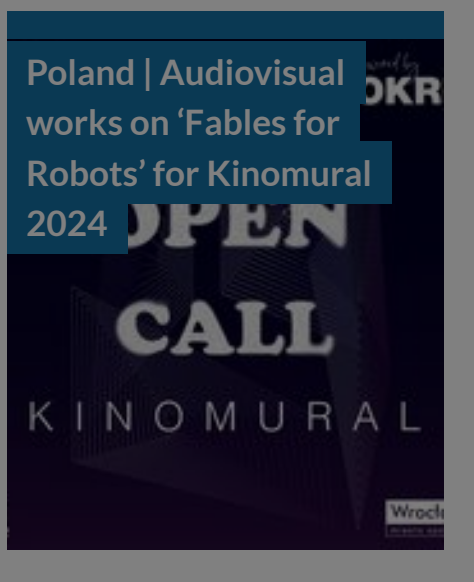
OPEN CALLS INTERNATIONAL POLAND