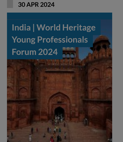
OPEN CALLS INDIA INTERNATIONAL