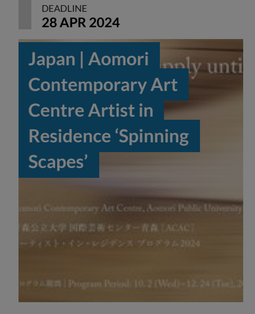
RESIDENCIES INTERNATIONAL JAPAN