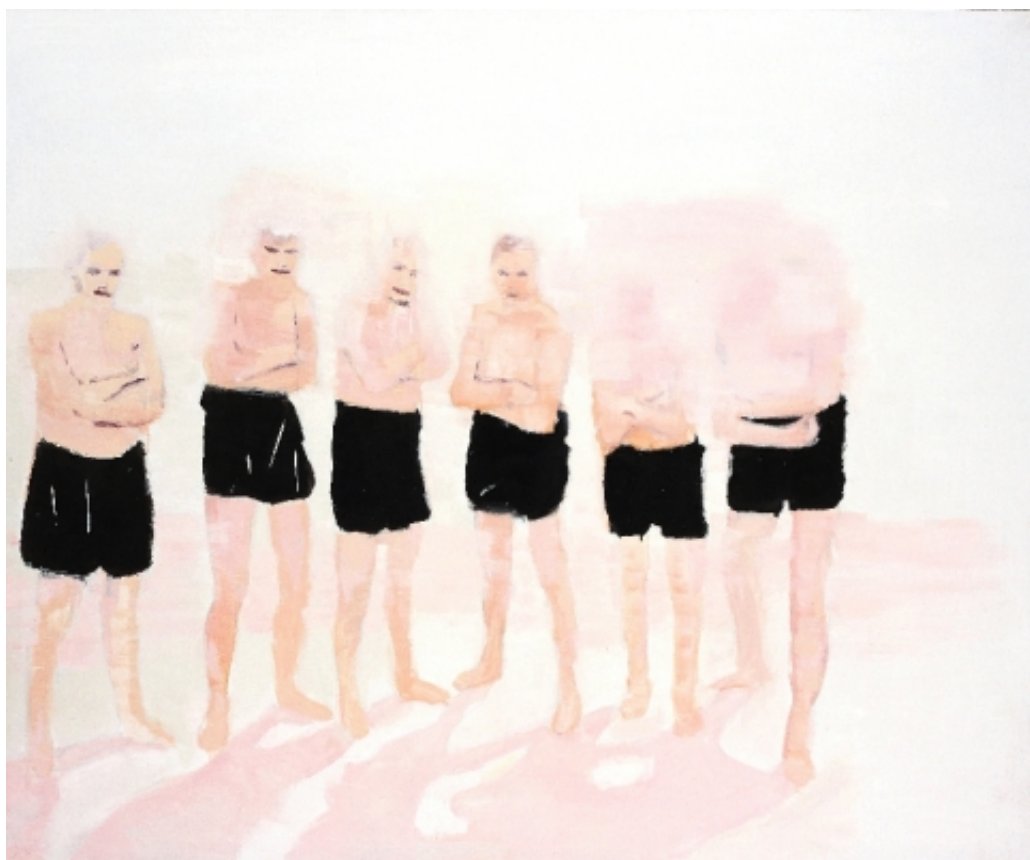
[caption id="attachment_24721" align="alignleft" width="386" caption="Adomas Danusevičius, Don't ask, don't tell. 170x140cm, oil on