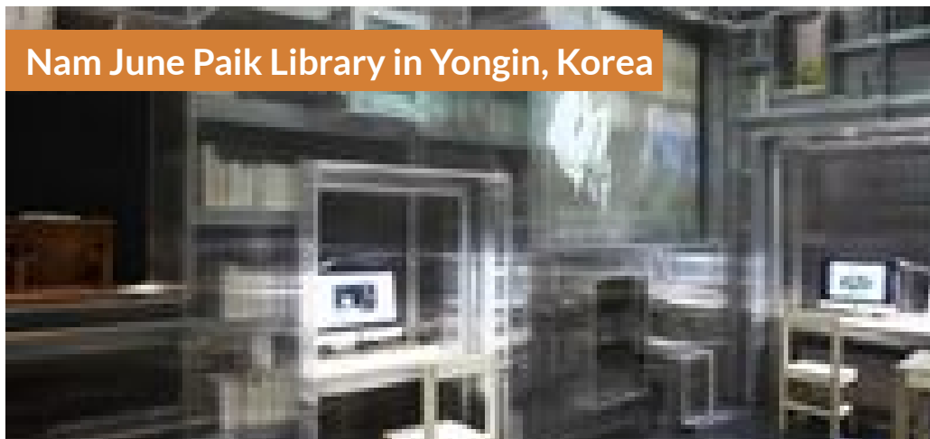
Nam June Paik Library in Yongin, Korea