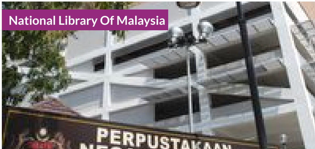
National Library Of Malaysia