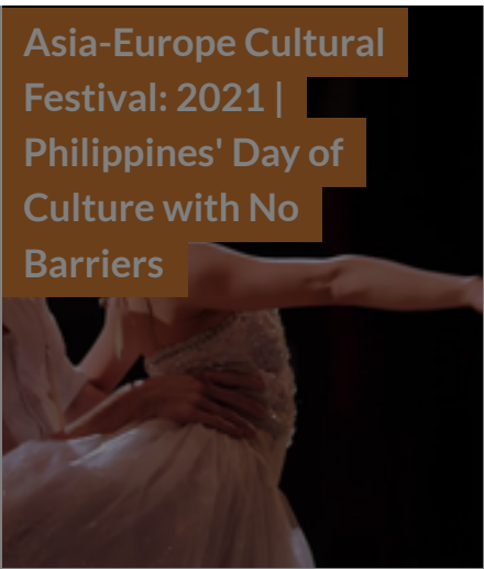
Asia-Europe Cultural Festival: 2021 | Philippines' Day of Culture with No Barriers