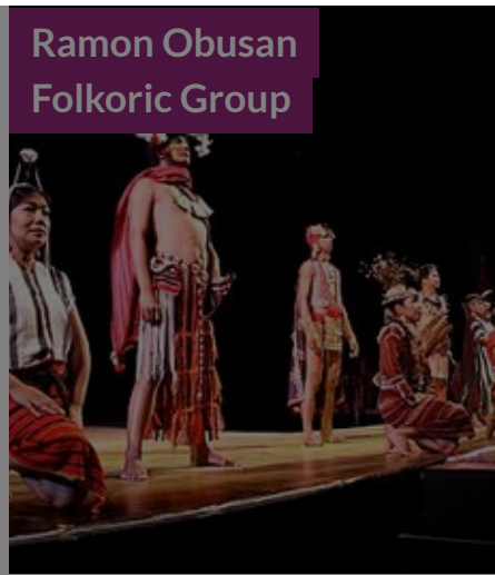
Ramon Obusan Folkloric Group