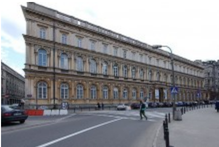
The State Ethnographic Museum in

Warsaw established in 1888, is the largest institution of its kind in Poland. It boasts the largest collection of ethnographic exhibits and archival records in the country, amounting to around 78,000 objects and over 170,000 various archival materials. Only a small part of the museum collection can be shown in permanent exhibitions at the museum. Aside from exhibitions, the museum has an effective role in scientific publishing, research and promotional activities regarding culture. Please note that the museum galleries are at present closed for major reconstruction. The Asian collection consists of over 4000 items. Among the most valuable are: Japanese wooden weapons, samurai swords, 17th-19th century weaponry, military items from India, Indonesia and the Middle East. Some of the most interesting collections are costumes from China, Korea, Japan, India and a set of Armenian metal dishes from Iran. Thank to co-operation with scientific and travel expeditions, the museum has been able to acquire an interesting collection from Afghanistan.